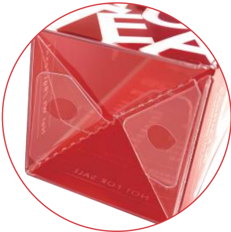
Automatic bottom buckle + soft thread

One push is combined, stand up and have a style and improve the grade of products